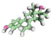
17β-estradiol, the major estrogen in the female and male body

Further studies in support of the theory have shown that suppressing the HPG axis, such as when organisms experience either caloric restriction, cold, or exercise stress, increases lifespan. This is thought to be an evolutionary conserved mechanism that allows organisms to suppress HPG axis signaling and reproduction,